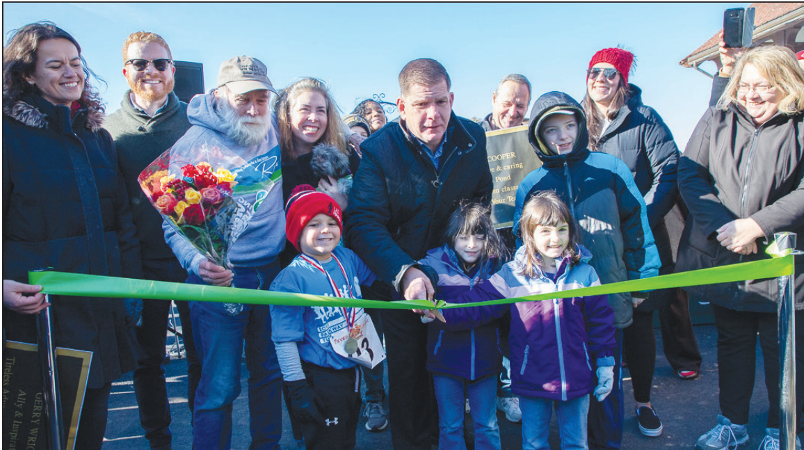
Mayor Martin Walsh gets some help from a few young folks to cut the ribbon and unveil the new pathways at Jamaica Pond.