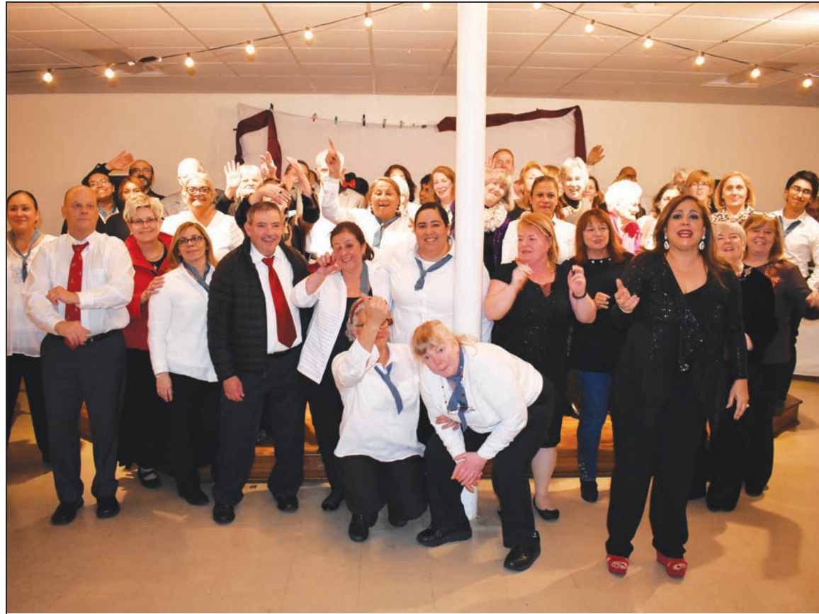
St. Thomas Aquinas Parish celebrated its 150th anniversary this past month with two big events: Mass with Cardinal Sean O'Malley on Sunday, Nov. 24, and a dinner/dance in the parish hall on Saturday, Nov. 30. Both events were well attended and brought former and current parishioners together to celebrate the 150th anniversary. The Parish was founded in January, 1869.