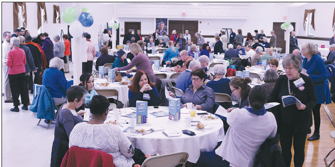
More than 150 business and community members joined Ethos on Thursday, November 7th, at the Our Lady of Lourdes Parish Center in Jamaica Plain, to support the organization's JP@Home program and celebrate the initiative's 5th Anniversary.