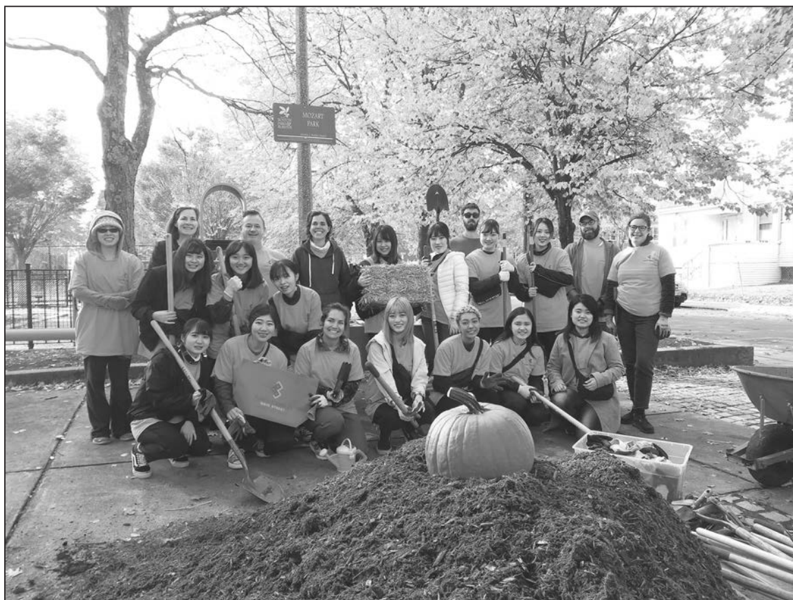
Shown above is the volunteer group for the October 26 Mulchcapade where 25 volunteers spread mulch on 90 street trees, planted 450 daffodil bulbs and perennial plants, picked up litter, and beautified spaces at Welcome Mural at Jackson Square, Mozart Park, Municipal Parking Lot, and along Centre Street.