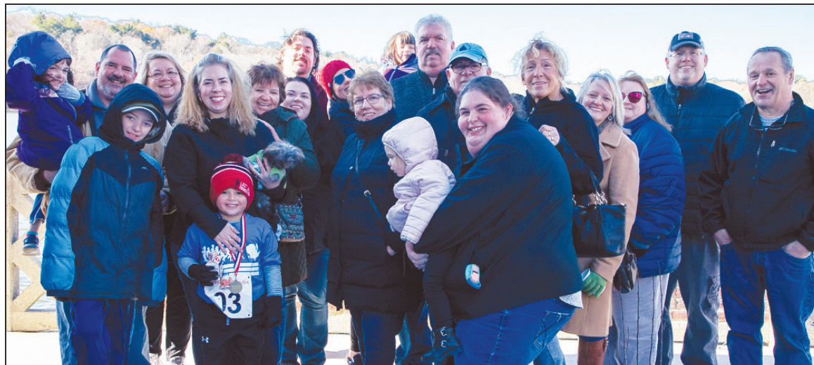
Members of the Cooper family.

The pathways project has produced major accessibility upgrades to the park. As a result of this investment, 100 percent of the entrances now meet ADA guidelines, including the boathouse plaza and 95 percent of the pathways throughout the park, an increase from 65 percent. Additional seating was also added along the pathways, half