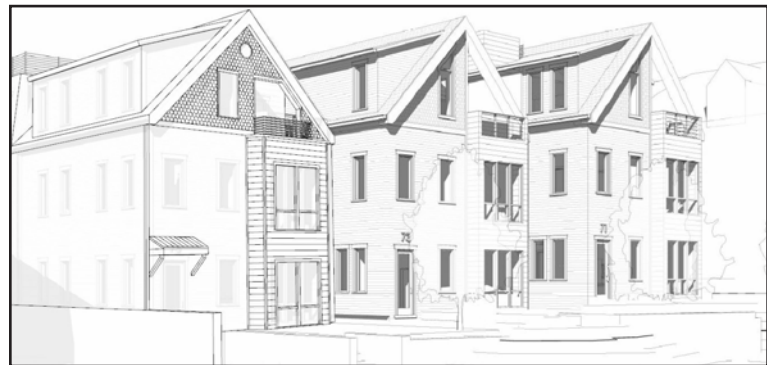
A rendering of the suggested improvements at 73 Sheridan St.